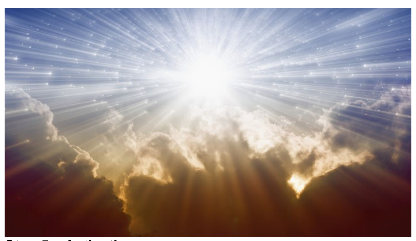
Step 5 – Activation Here's the breakdown of benefits: